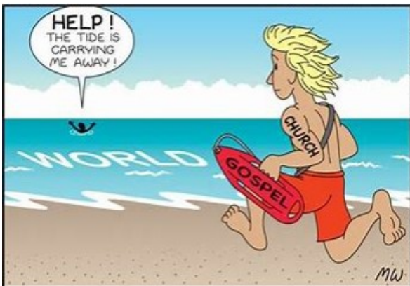
He will bring you a message through which you and all your household will be saved. — ACTS 11:14 NV